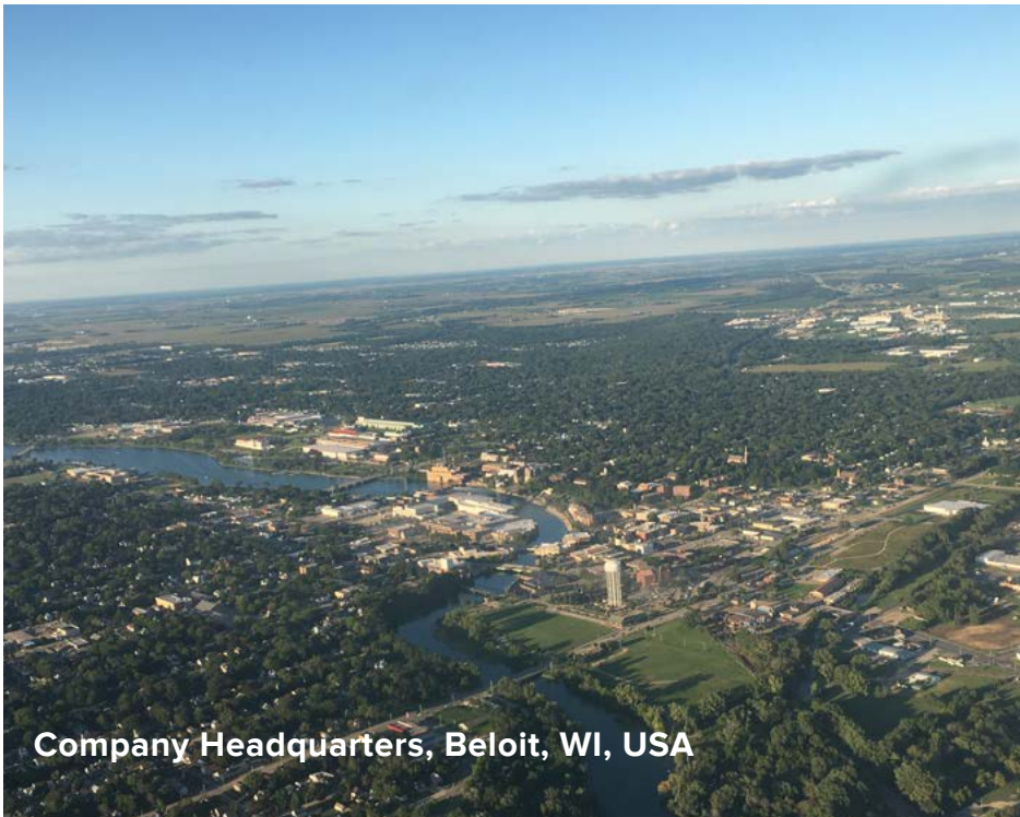
Company Headquarters, Beloit, WI, USA